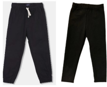
black jogging bottoms/ leggings