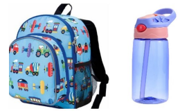
small rucksack and water bottle

PARENT SURVEYS As a school, your opinions and feedback matter to us greatly. Thank you to those parents/carers that completed our latest questionnaire. Here are the results: