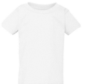
red/white plain t-shirt